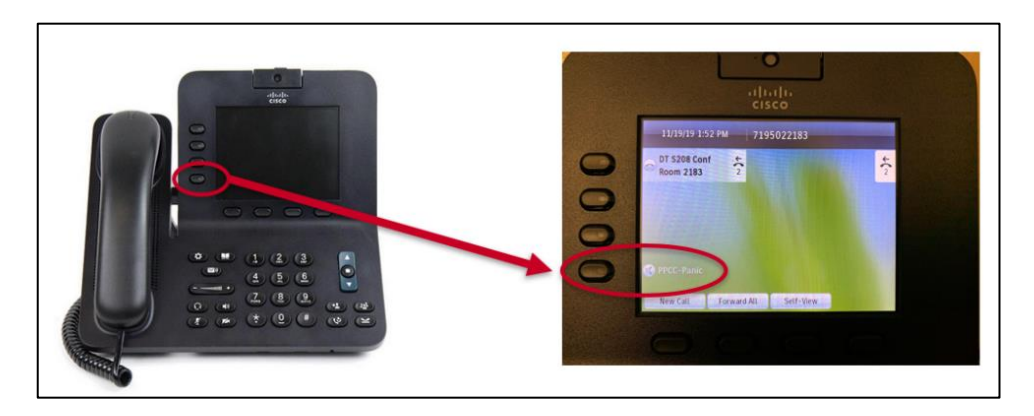
"Panic Button" feature on PPCC campus phones.